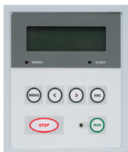
Fig. 2. Control Panel

PS5023 flashlamp driver is designed for pumping solid-state lasers with variable or long pulsewidth lamp discharge. It features variable pumping pulse in 0.5 – 10 ms range and output voltage of up to 550 V. Custom versions can achieve tens of milliseconds pulse duration.